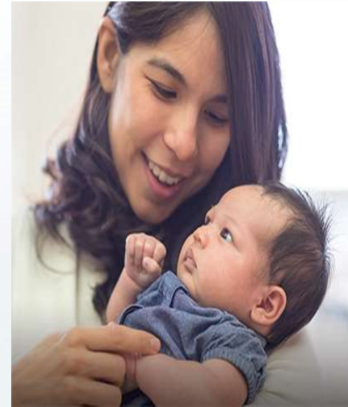
11371 Aid and Support Guide Book